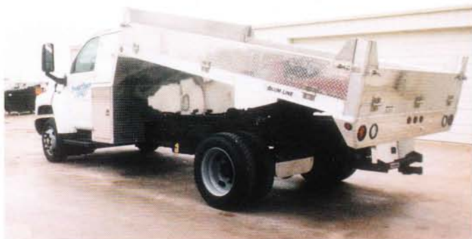
16. ALUM-LINE dump body platforms are heavy duty. Special strength options include; 1/2" thick outside framing with 1 1/4" extruded flooring. Channel long sills and heavy duty bulkheads complete the package.