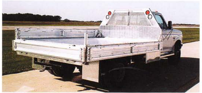
13. A 12' length standard platform with a mesh window protector. Please note the fold down sides. Available in various lengths. ALUM-LINE beds are easily converted to your next truck.