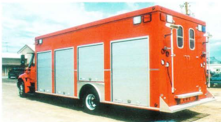
20. Rescue body with 60" box height. Four compartments per-side and finished in .125 smooth aluminum painted sides. Rear step bumper and rolled fender flares. More information is available on our complete line.