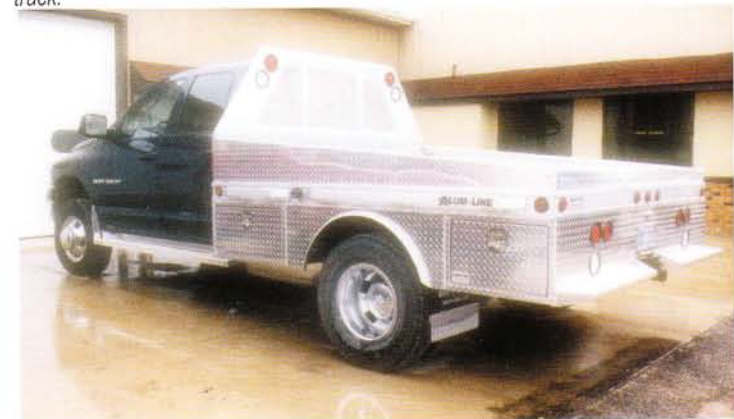
9. Give your bed a personal touch. Extra boxes, rub rail, wheel flairs, plus more. All types of lengths and widths available.