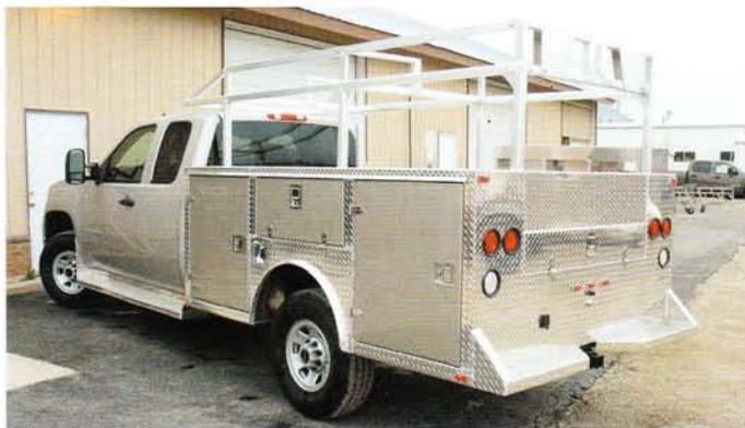
19. One of our most popular set ups. Compartment height at 40" with overhead ladder rack and step bumper. Other popular options include 4" deep flip top compartments on top, adjustable shelving, slide out trays, painted doors and much more. All models available in smooth or treadbrite aluminum construction.