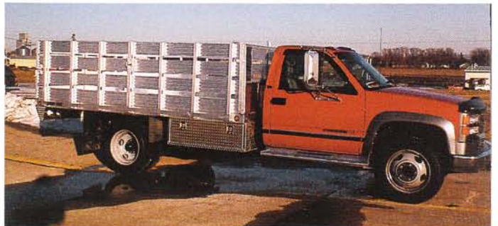
15. Truck bed with 36" high stake rails. Stake racks are available in any height or in solid sides. Sides are light weight and are easy to install or remove. Rear doors can be pull-out or swing-out design. Used with rub rail with stake pockets.