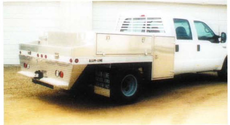
2. Equipped with optional above bed tool boxes, upright front tool boxes, rear step bumper, louvered bulkhead and short sides. You can build a body your way.