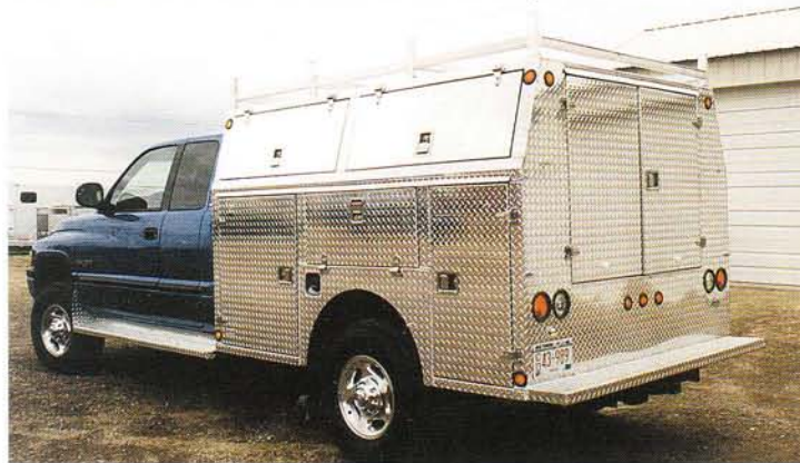
21. All types of customizing available including: shelving, transverse compartments, roll out trays, double pan doors, door stops, special latches, hanging hardware, and interior lighting. Our rescue bodies have been used and approved by the U.S. Army.