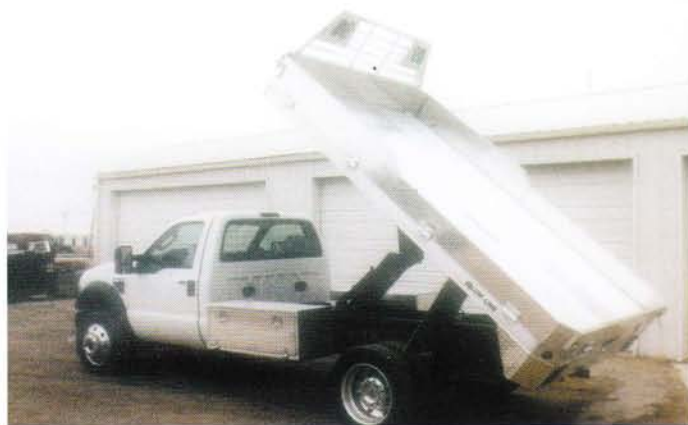
17. Bed capacities up-to 12 ton are available. Our extruded flooring offers easy dumping. Permanent solid sides come in a variety of heights and in either smooth, extruded, or diamond plate material.