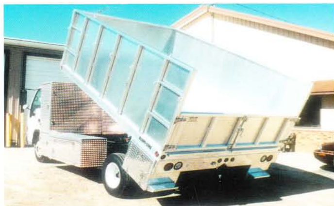
18. Special dump body set up using a "Back Pack" behind the cab. "Back Packs" provide extra storage for large tools, shovels, etc.. Please note the removable stake sides for multiple use.