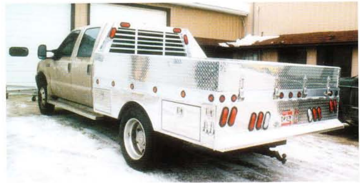
8. Another choice of sides can be matched to almost any inch increment you desire. All hitches used with ALUM-LINE beds are attached to the frame of the truck.