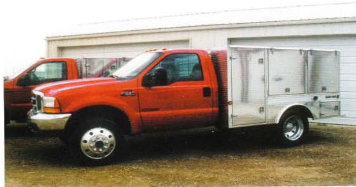
6. Special use service trucks can be designed to fit your needs. ALUM-LINE has designed a variety of bodies for rescue and brush fire service.