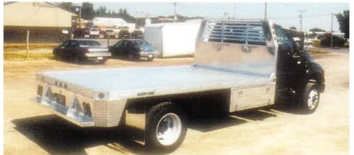
14. ALUM-LINE will build beds up-to 24' in-length and 20,000 lb capacities. Special strength features include: 1/2" thick outside rail, 3" I beam, 1/4" wall cross members on 12" centers, and 1 1/4" extruded flooring. Put our bed to the test... You will be very satisfied. All types of loading ramps available.