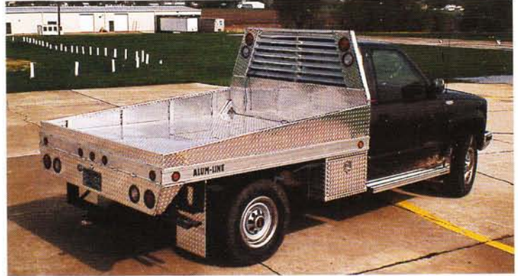
7. Our most popular truck bed package. Louvers and lights, tapered side boards, underbody tool boxes, mudflaps, and fifth wheel trap door.