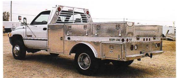
3. Component body. With our special front corner cutouts, you can have tall upright boxes yet the strength of a platform body. Extra storage includes removable top boxes and small boxes behind the wheels. A lower price alternative to a service body.